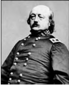
Maj. Gen. Benjamin F. "The Beast" Butler