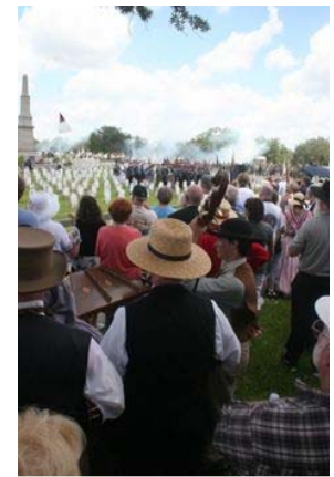
Funeral for Confederate Sailor CSS Alabama