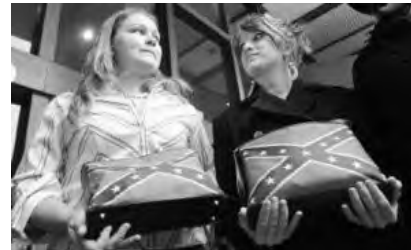
These Young Ladies Purses have been Banned from their Burleson Texas School